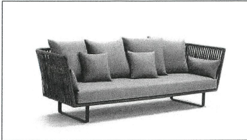
Figure Q4(c): Rattan Sofa